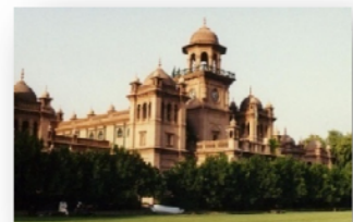
Islamia College, University of Peshawar

Peshawar is situated near the eastern end of the Khyber Pass and sits mainly on the Iranian plateau along with the rest of the NWFP. The Peshawar valley is nearly circular bounded on the North and North East by hills, which separate it from the Valley of Swat. In the