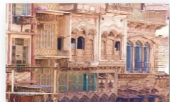
Facades in Peshawar's Walled City

Peshawar is a district in the North-West Frontier Province of Pakistan. At independence in 1947 the old Peshawar District became Peshawar Division, containing the current district of Peshawar until divisions were abolished as part of local government reforms in 2000. The city of Peshawar is the capital of district as well as province. "Peshawar" literally means The High Fort in Persian and is known as Peshawar in Pashto.