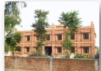
New Museum, Mardan

Mardan District is in the North West Frontier Province of Pakistan. Mardan district was a part of Peshawar district. In 1937, Mardan was set up as an independent district after the name of its headquarters town. Most of its land is agricultural. It has one of the world's best irrigation systems, which was laid down by the British government during British Rule on subcontinent (1857-1947).