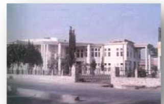
Town Hall, Mardan

Mardan district may broadly be divided into two parts, North-Eastern hilly area and south western plain. The entire Northern side of the district is bounded by the hills. The southwestern half of the district is mostly composed of fertile plain with low hills strewn across it. It is bounded on the north by Burner district and Malakand protected area, on the east by Swabi and Burner districts, on the South by Nowshera district and on the west by Charsadda district and Malakand protected area. The total area of the district is 1,632 kilometers.