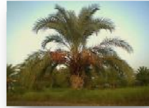
Dhakki Date Tree

This area is rich in ancient history, as proven by the excavation of Rahman Deri. Archeological relics at the Kafir Kot Fort and nearby temple provide evidence of Hindu Shahi rule.