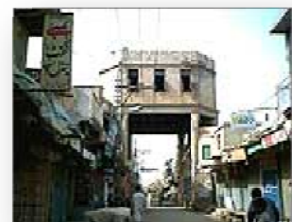
City of DI Khan

Despite being situated on the bank of the Indus River, the area is dry and very hot. The city lacks basic urban infrastructure like potable water, fuel gas, railroads and adequate health care. It is located on the Indus Highway which links Pakistan