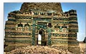
Tomb at Lal Mohra 2 | Page