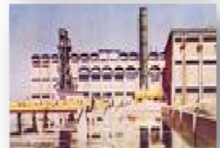
Sugar Mill, Charsadda