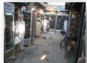
Chapli Market, Charsadda