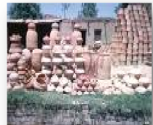
Pottery Shop at Charsadda

Situated in the productive and well-watered Peshawar plain, the land of Charsadda is very fertile and beautiful. There are three rivers flowing in Charsadda: the River Jindi, the Kabul River, and the Swat River. These are the main source of irrigation. The popular crops are Sugar Cane, Sugar Beet, Potatoes, Edible Oils, Onion, Maize, and wheat.