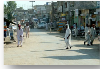
Street in Bhimber

The people of this area are basically agriculturalist, belonging to Jatt and Rajput castes, with strong cultural links to the Pothwar region of Pakistan. Therefore culture of the district resembles that of the adjoining areas of Punjab. Tribal loyalty is important to most people. Traditionally, marriages are arranged within ones tribe, and inter tribal marriages are rare. The people of Bhimber are militant and the area was traditionally a recruiting ground for the British Indian army. The people of the district are intelligent, ingenious, hard working, mobile and skilful.