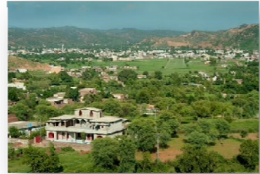
A view of Bhimber

Bhimber town is located at a distance of 50 kilometers from Mirpur and 166 kilometers from Rawalpindi. This town is connected both with Mirpur & Gujrat through all weather black top roads. All the basic amenities of life are available in Bhimber.